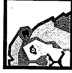
Home of the Lions