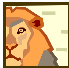
Home of the Lions