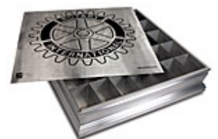
Rotary Time Capsule

A Centennial Service Project of The Rotary Club of Marshfield, Missouri, USA, the Rotary Time Capsule is made of highly polished stainless steel and measures 6 x 6 feet and 3 feet deep. Club presidents and club presidents-elect from more than 32,000 Rotary clubs will deposit into the time capsule centennial letters expressing each clubs' accomplishments and dreams. In 2105, the capsule will be opened and its contents shared with tomorrow's Rotarians.