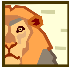
Home of the Lions